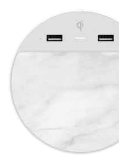
Station C with custom marble laminate

Tech products don't have to be boring black boxes. Feature your custom color palette, prints, patterns and artwork to extend your unique style onto the nightstand.