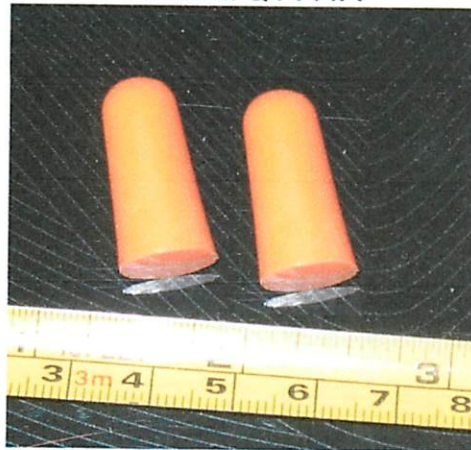
Test Item: Q1441A

These data were obtained through measurements made at the laboratories of Michael & Associates, Inc., State College, PA, USA. Michael & Associates, Inc., is accredited to test to ANSI S3.19-1974, ANSI S12.6-1997 and AS/NZS 1270:2002 by the National Institute of Standards and Technology (NIST) National Voluntary Laboratory Accreditation Program (NVLAP).